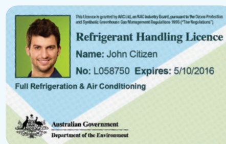
Refrigerant handling licence

A list of all staff at your organisation who hold a current Refrigerant Handling Licence including name and licence number.