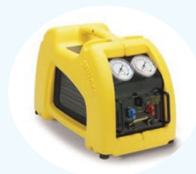
Refrigerant recovery unit