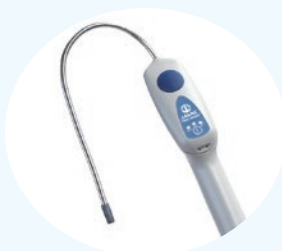
Electronic leak detector

Make sure you keep quarterly records of inspection and/or maintenance of the equipment, and ensure it is working correctly.