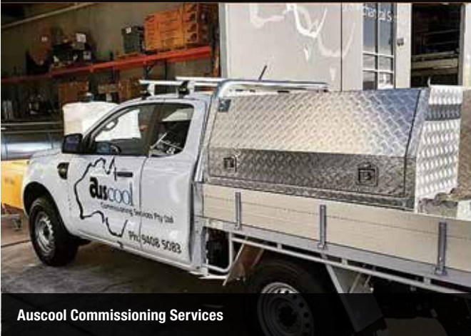
Auscool Commissioning Services