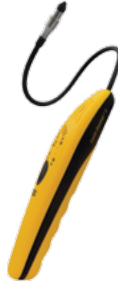
b Electronic refrigerant leak detector