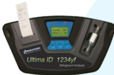
e Refrigerant identifier