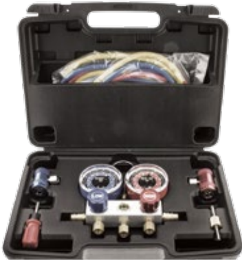
a Calibrated gauge set