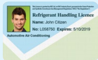
Refrigerant handling licence

You must display your RTA number on any advertising that promotes refrigeration and air conditioning services, and on any invoices, receipts or quotes for work carried out under the RTA.