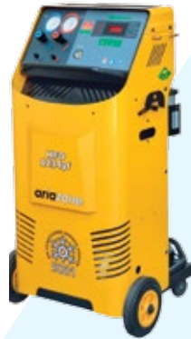
d Recovery/reclamation unit