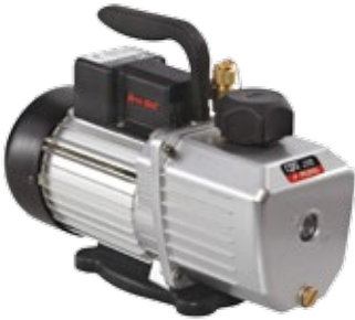
c Vacuum pump