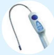
Electronic leak detector

Make sure you keep quarterly records of inspection and/or maintenance of the equipment, and ensure it is working correctly.