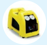
Refrigerant recovery unit