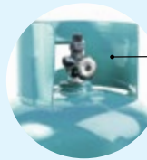
Cylinder test date (generally stamped into the handle/collar of the cylinder)

A list of all refrigerant containers (cylinders) in your possession during each quarter and their test dates. In addition, quarterly records that show you have checked your cylinders for leaks, at least once during the quarter.