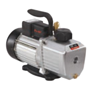
C Vacuum pump