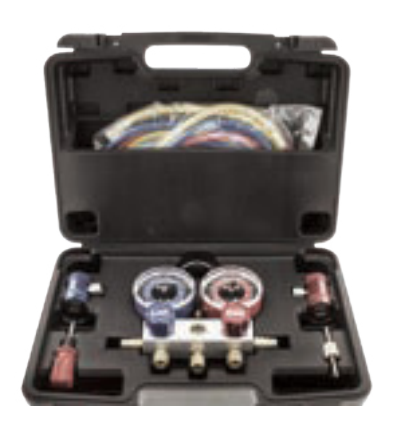
a Calibrated gauge set